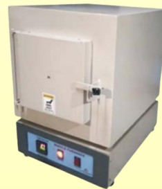
MUFFLE FURNACE FOR ASH-CONTENT CHECK