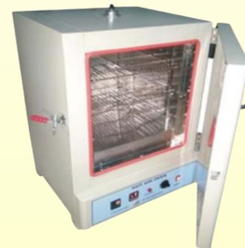
HOT AIR OVEN FOR MOISTURE CONTENT CHECK